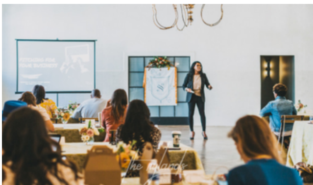
Note: Presentations can be personalized to fit your audience's culture and needs.